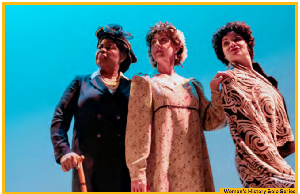
Women's History Solo Series